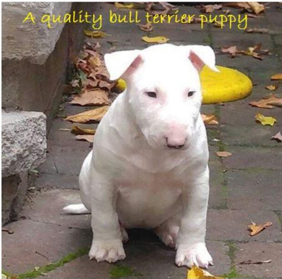
A quality bull terrier puppy