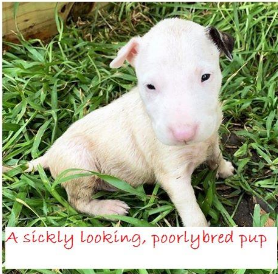
A sickly looking, poorly bred pup