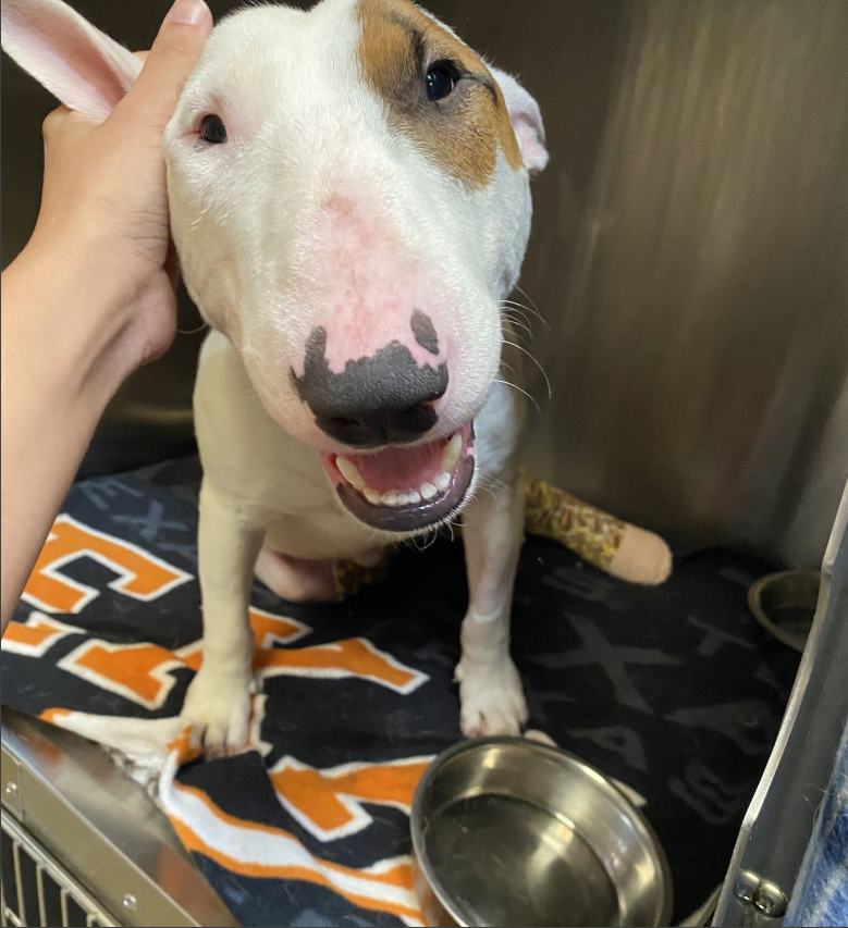
WRANGLER | ADOLESCENT