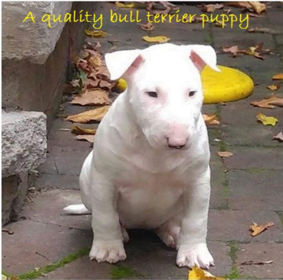
A quality bull terrier puppy