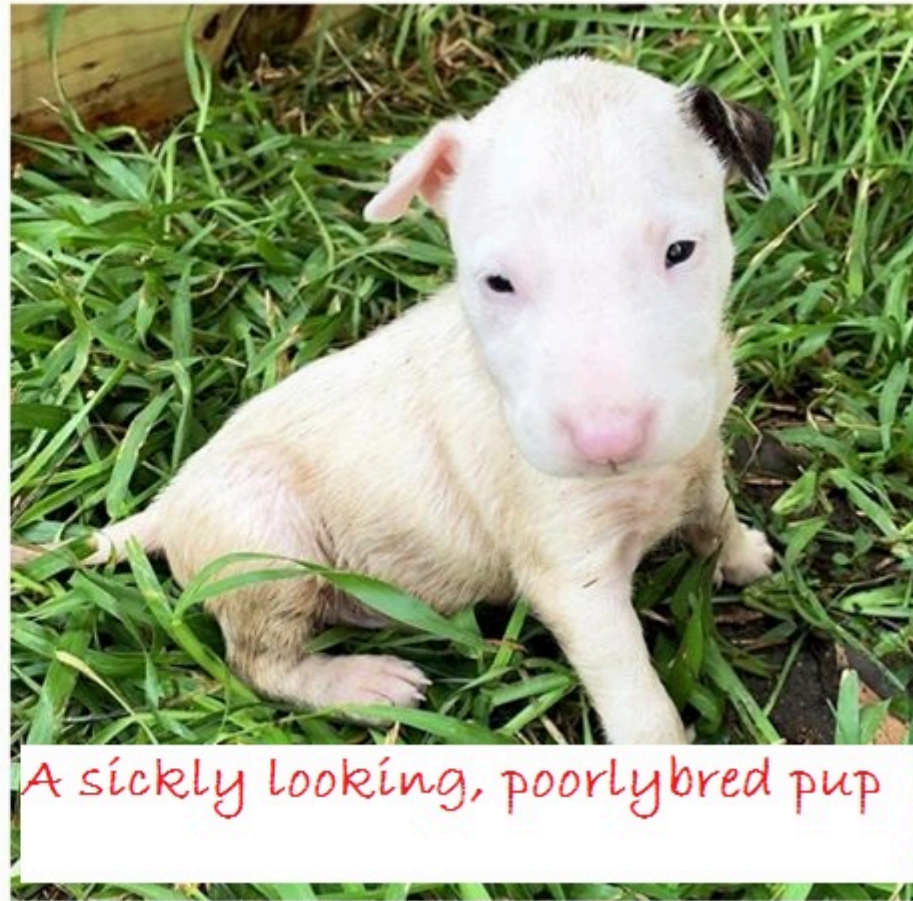
A sickly looking, poorly bred pup